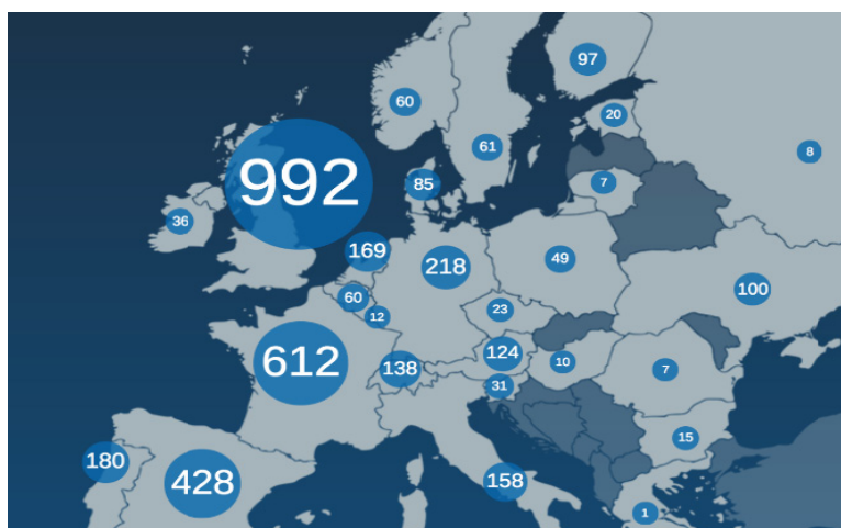
Figure 2. Start-ups in Europe that received accelerator investments (Gust, 2016)

Germany focused on high quality pharmaceuticals, automobile and telecommunication. The government has realized the importance of supporting start-ups and different initiatives have been set up to support this sector into growth. The Digital Economy Action Programme has been put up to give support by the German government. D’Avino states that, «governments around the world have amended regulation and created incentives to encourage development of start-ups» [6]. Rispers and Troger state how the German start-up centers are Berlin, Munich and Hamburg. Founders have been known to move to Munich and Stockholm due to access to capital and talent [13]. As presented in Fig. 2 on the Average Age of Start-ups, it is evident that Belgium and Sweden are the best ecosystems for start-ups with the average age of start-ups being 5.3 years for Sweden and 3.7 years for Belgium followed by Spain at 3.8 years. Romania is at the lowest at 1.3 and Czech at 1.8 years. This explains the technological start-up environment in Europe. The UK received the highest investment of more than 15.5 million Euros for 992 start-ups followed by Spain and Germany. Almost half (47 %) of these investments in Europe were made equity-free, meaning without any dilution of ownership.