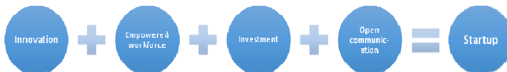
Figure 1. Elements of Start-up

Start-ups of the current world are characterized by having a highly motivated workforce [12]. With a lot of start-ups in Europe hiring staff with a share option, they enjoy increased freedom and expression. This leads to more transparency and effective communication with a customer-centric approach. Figure 1 below is designed as a short summary of the most important elements that represent a start-up, according to the authors of the article.