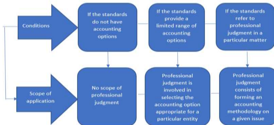
Figure 1. Scope of application of an accountant's professional judgment Note - developed based on sources (Gubaidullina, 2014; Druzhilovskaja, 2013).

Professional judgment is necessary when measuring the value of an object, determining future economic benefits, damages, expenses from the object, how reliably these indicators can be measured. It is also used in the formation and disclosure of the company's financial statements.