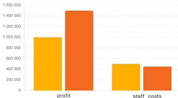
Figure 2. The impact of HRM on the financial performance of organizations

Note — compiled by authors based on correlation and regression analysis of organizational data